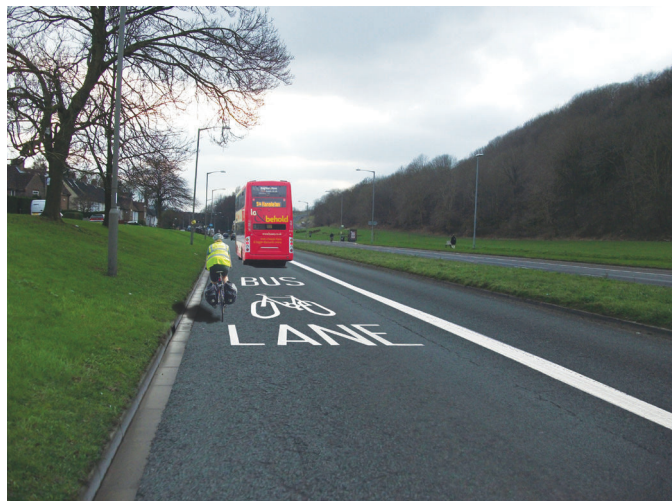
Option 1 – Shared bus / cycle lane

metres. In option 2 the desired width of the cycle lane would be 2 metres and the bus lane 3 metres. Junction Improvements at the Saunders Park View and Coombe Road junctions are also proposed, with particular benefits for pedestrians and facilities for cyclists.