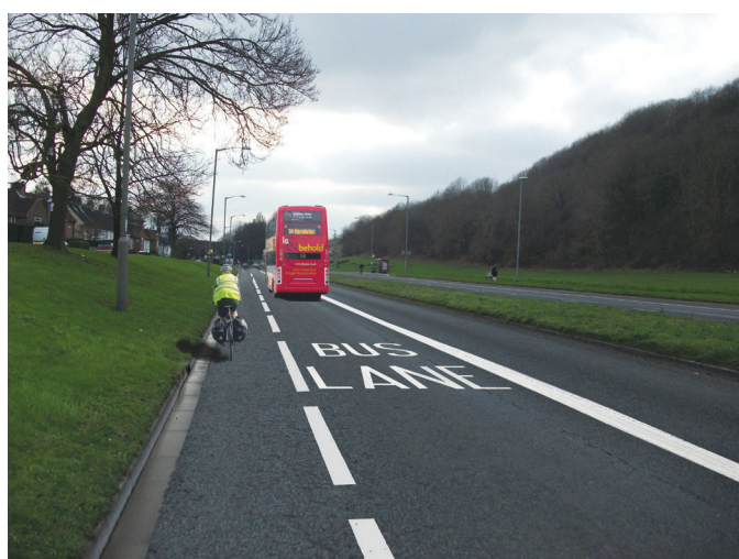
Option 2 – Separate bus / cycle lane

Further changes are proposed on the east side of Lewes Road between Natal Road and the Vogue Gyratory. This area is currently unpleasant for cyclists due to the parked cars between the cycle lane and pavement, while the narrow and uneven pavements are unpleasant for pedestrians. In order to provide a wider pavement and maintain sufficient width for the bus and cycle lanes, it would be necessary to remove the free parking bays located here. Parking surveys undertaken show that these spaces are mainly used by people parking long term and free of charge for the University of Brighton and the Bus Garage. Loading facilities and disabled parking would be provided where necessary.